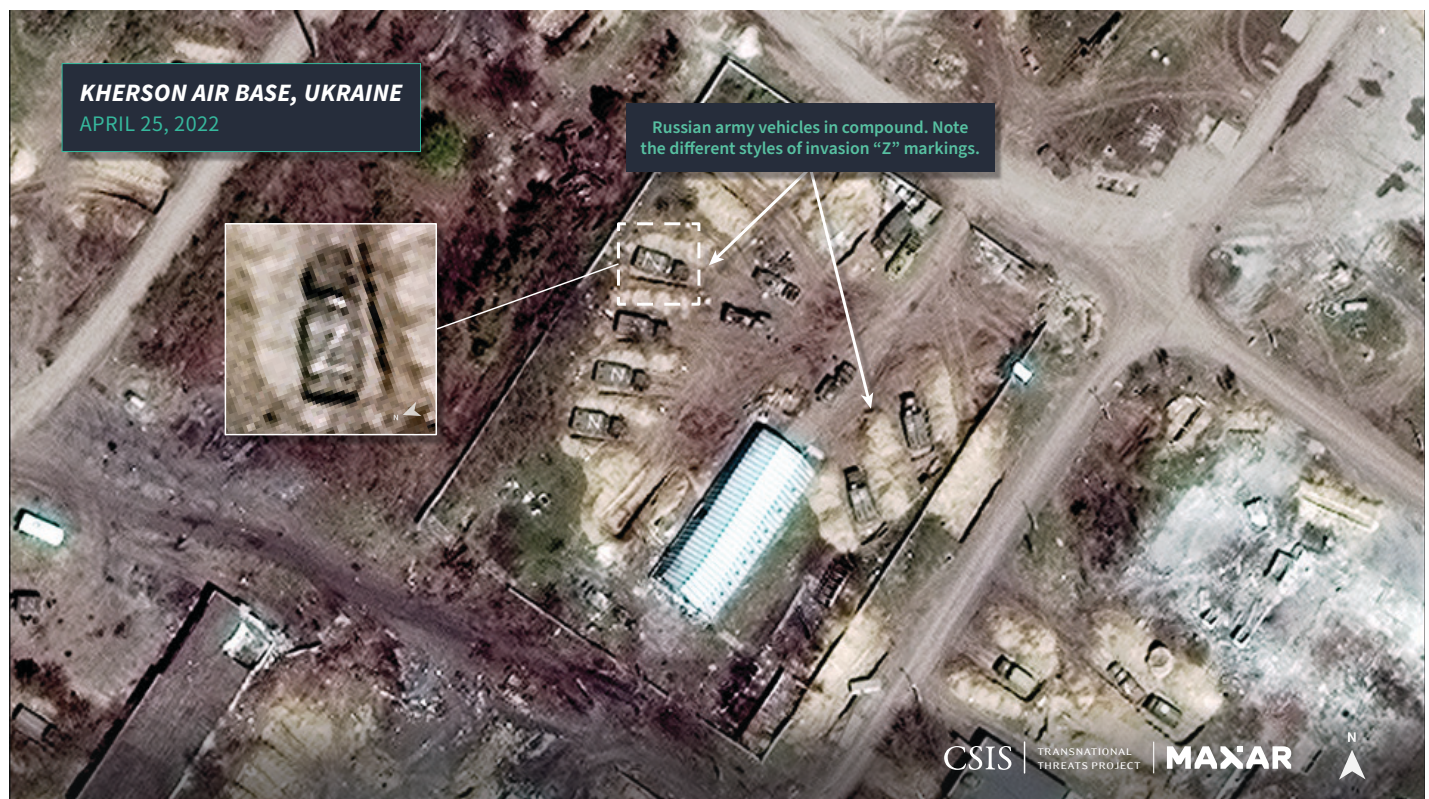
Figure 2: Russian Army Vehicles with Invasion "Z" Markings

First, the Russian army faced significant logistical and maintenance challenges operating in contested areas inside of Ukraine. Russia's approach to combined arms warfare was generally to hammer Ukrainian positions with artillery and other stand-off weapons and then to send armored vehicles forward on a maneuver termed "reconnaissance to contact," designed to overwhelm what remained of Ukrainian defensive lines. 26 But because of the Ukrainian military's effective use of anti-armor munitions, such as anti-tank guided missiles and loitering munitions, Russian ground forces had difficulty advancing and seizing ground. This was true even when the speed of some Russian armored units allowed them to push into Kyiv's suburbs only 48 hours into the war. Some of these Russian units were isolated with limited or no logistics, miles ahead of the main body of Russian ground units. 27