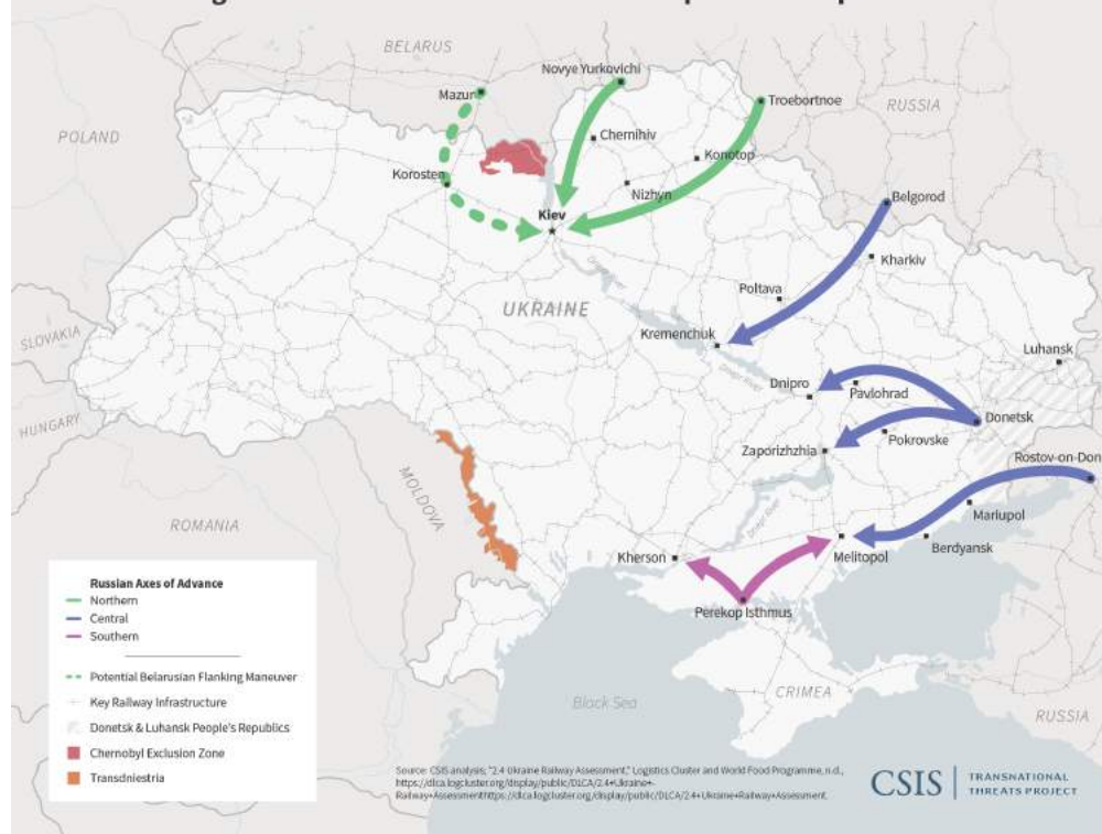
Figure 2a: Russian Seizure of Ukraine up to the Dnepr River