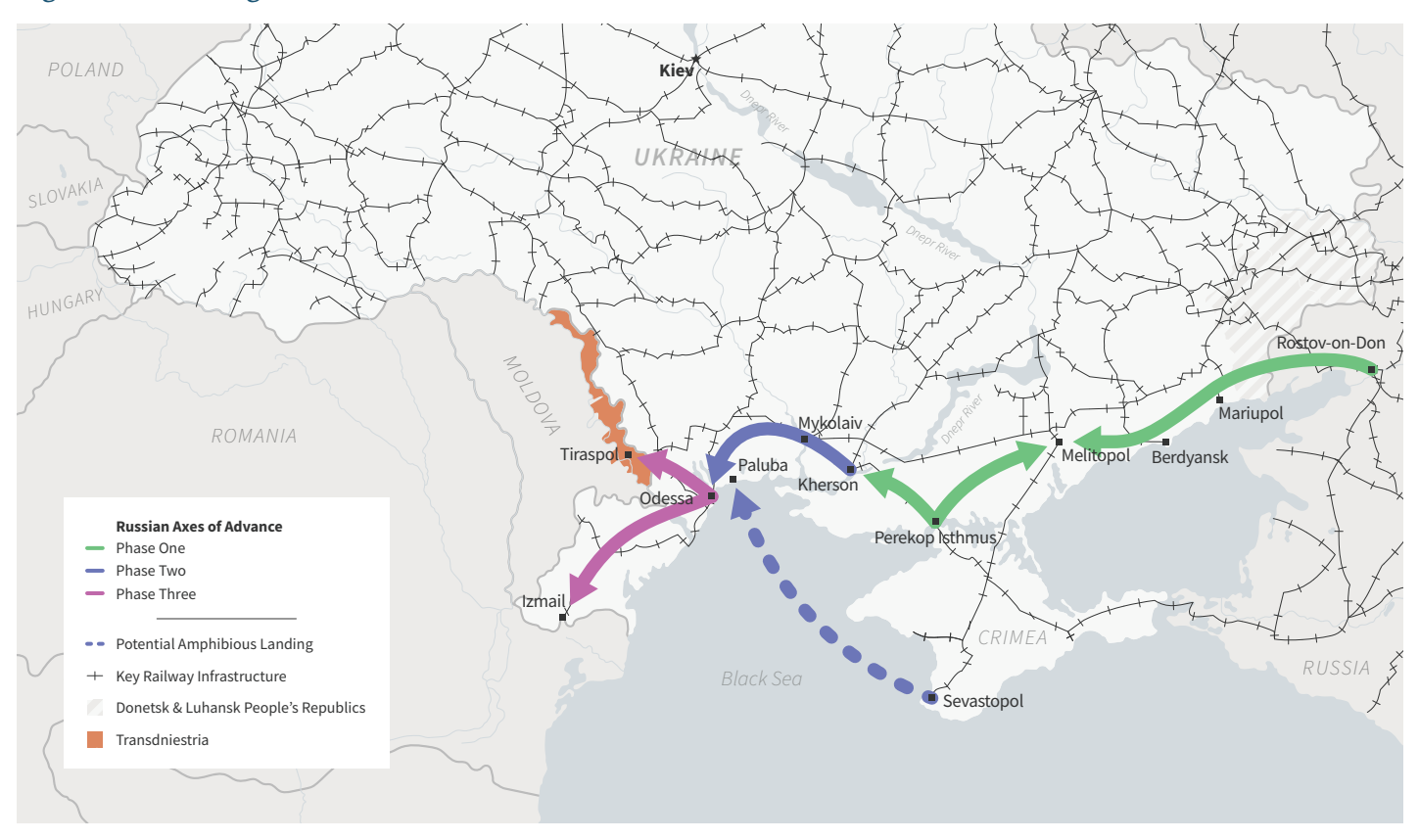
Figure 2b: Linking Russia with Crimea and Transdniester

Mechanized attacks are not always as rapid as attackers hope. Two of the quickest movements of armored forces in history—German general Heinz Guderian's punch through the Ardennes and seizure of Dunkirk in May 1940, and the U.S. and coalition advance from the Kuwait border to Baghdad in 2003—each averaged approximately 20 miles per day. Movement against a determined foe in winter