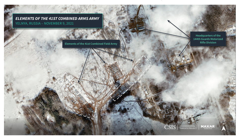
Figure 1b: Close-Up of Russian Military Buildup near Yelnya, Russia