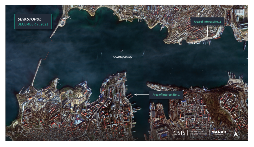
Figure 3b: Close-Up of Russian Landing Ships in Sevastopol