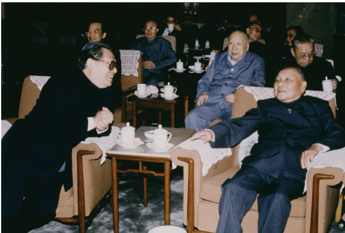
General secretary of the Central Committee of the Chinese Communist Party Jiang Zemin and chairman of the Central Military Commission Deng Xiaoping.

As in any political system, these rules were molded by the short-term considerations. In 1997, then-general secretary Jiang Zemin pushed out a Politburo rival, Qiao Shi, by declaring a 70-year-old retirement rule, even though Jiang himself was 71 at the time. 8 Jiang successfully pulled off a similar maneuver in 2002, now lowering the age limit to join the Politburo to 68, thus ending the career of another rival, Li Ruihan. Despite the circumstances of their creation, these rule changes have had an enduring impact.