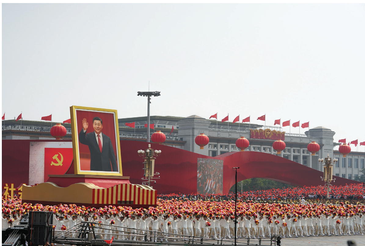
A portrait of CCP general secretary Xi Jinping is carried during the parade for the 70th anniversary of the establishment of the People’s Republic of China, on October 01, 2019, in at Tiananmen Square, Beijing, China.