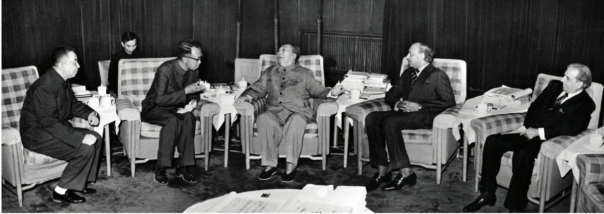
A picture released by Chinese official agency shows Mao Zedong (C) on May 27, 1976, in Beijing during his meeting with Pakistani prime minister Zulfikar Ali Bhutto.