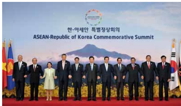
Heads of state celebrate the ASEAN-Korea Commemorative Summit in 2009 on the 20th anniversary of the establishment of the South Korea-ASEAN Dialogue. Leaders will meet again in December to celebrate the dialogue's 25th anniversary. https://www.flickr.com/photos/koreanet/4345493742/