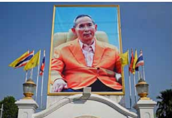
A portrait of King Bhumibol Adulyadej, 86, commissioned for his 60th birthday. King Bhumibol recently endorsed an interim constitution proposed by Thailand's military coup leaders.