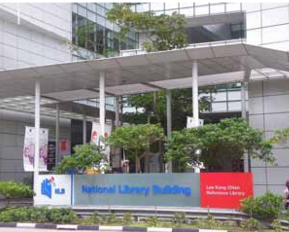
The National Library of Singapore. A recent decision to pull two books featuring same-sex couples from bookshelves in Singapore's libraries has sparked a heated debate in the city-state.