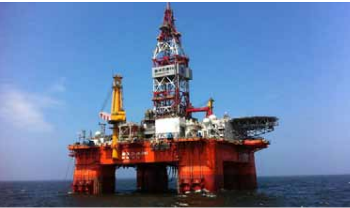
China's $1 billion oil rig, which it recently pulled from disputed waters in a surprise move.

the typhoon did influence the timing of the withdrawal. As Carl Thayer has pointed out , the drilling rig was built to withstand typhoons, but the more than 100 Chinese vessels protecting it were not. But withdrawing the rig to waters off Hainan Island, as CNPC declared it would, was neither necessary nor the safest course. That is where Rammasun was headed. Instead, China could easily have pulled the rig back into the protection of the Paracels.