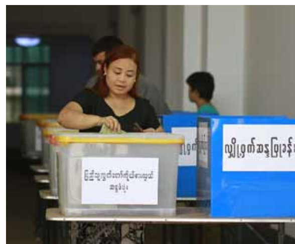
A woman votes in Myanmar’s 2012 by-elections, which were nearly swept by the opposition National League for Democracy. The opposition is now criticizing draft regulations from the Union Election Commission governing 2015 national polls. http://commons.wikimedia.org/wiki/File:Burma_By-Election_2012.JPG