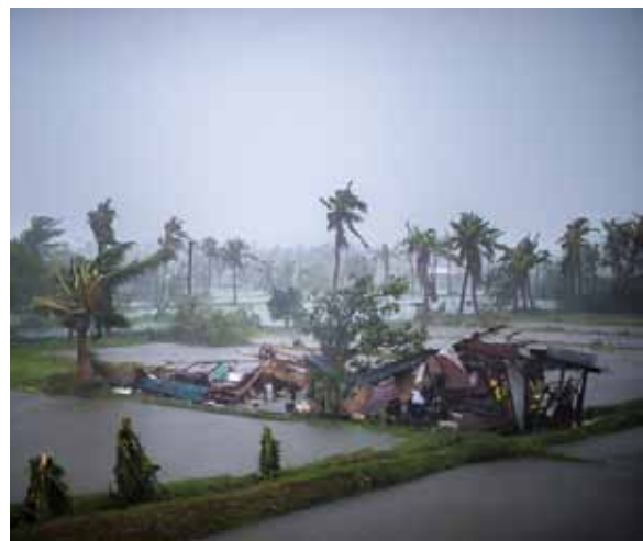
Typhoon Rammasun, which killed nearly 100 people in the Philippines, sweeps through Laguna province, southeast of Manila. Wind speeds measured nearly 75 miles per hour in some areas, causing power outages for millions.