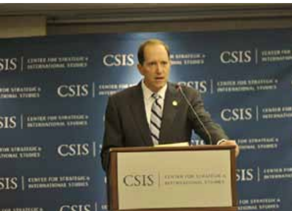
Chairman of the U.S. House of Representatives' Ways and Means Committee Dave Camp speaking at CSIS on August 16, 2013. Camp and his fellow Republicans on the committee have said they will oppose ratification of the Trans-Pacific Partnership if the administration does not first obtain trade promotion authority.