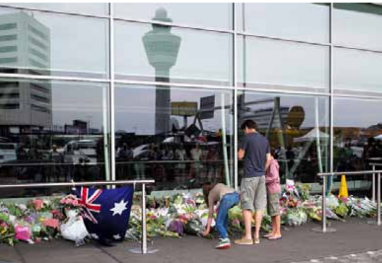
A makeshift memorial at Amsterdam Schiphol Airport for the victims of Malaysian Airlines Flight 17. Malaysian authorities have said they negotiated the return of remains and flight recorders from the flight, as well as access to the site.

• Malaysia negotiates for remains, black boxes, site access to downed flight MH17. Prime Minister Najib Razak said July 21 that his government had successfully negotiated with the separatist administration in Donetsk, Ukraine, for the transfer of the remains of 282 of the people on board and the two flight recorders from Malaysia Airlines Flight 17, along with access for investigators to the crash site. The flight was shot down by Ukrainian separatists on July 17 using equipment that U.S. and other leaders have said appeared to be provided by Russia. Separatists have so far prevented international investigators from examining the crash site. The UN Security Council on July 21 unanimously passed a resolution demanding an independent investigation.