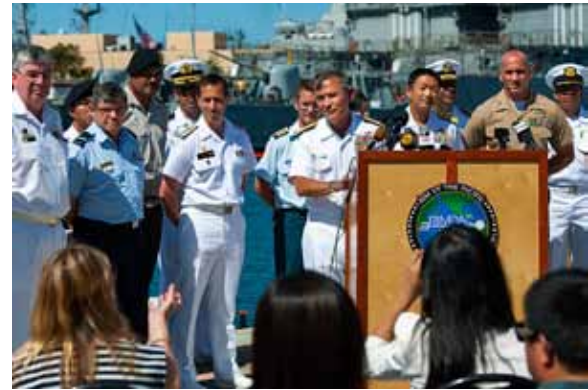
Adm. Harry Harris, commander of the U.S. Pacific Fleet, at the opening ceremony of the ongoing Rim of the Pacific (RIMPAC) exercises at Pearl Harbor. China is taking part in RIMPAC for the first time, adding some much-needed momentum to U.S.-China engagement.

For the United States and its partners, this means that the ARF should be approached on two fronts. Secretary of State John Kerry can play an important role in offering support to ASEAN ministers—stiffening their spines in a sense—in taking a firm stand against China's recent activities in the South China Sea. Most importantly, he can rally international endorsement for any consensus position they might take, especially if it includes a freeze on activities in disputed waters and an endorsement of the right of all parties to resort to arbitration.