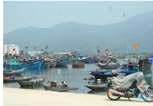
Fishing boats at Danang, Vietnam. China arrested and subsequently released 13 Vietnamese fishermen working near the Gulf of Tonkin, but confiscated one of their boats and their fishing equipment.