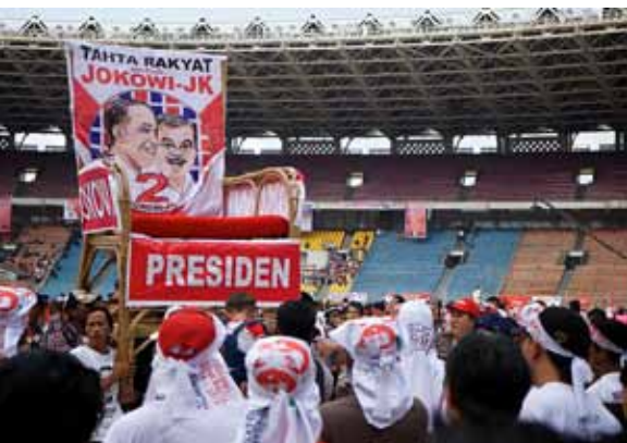
Supporters of president-elect Joko “Jokowi” Widodo carry a chair bearing a sign that endorses his presidential ticket ahead of a July 5 concert. Indonesia’s election commission on July 22 declared Jokowi the victor in Indonesia’s 2014 presidential race.