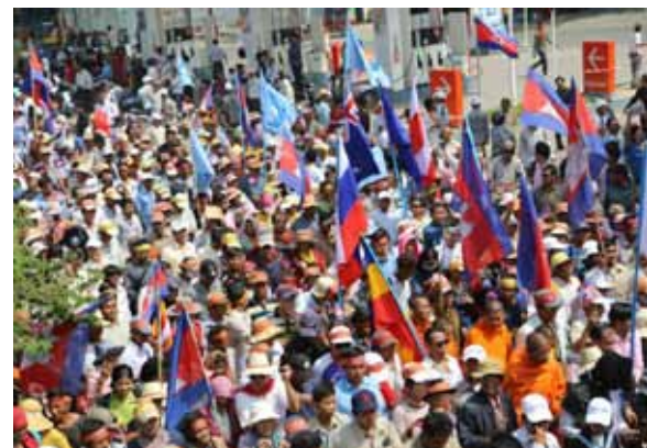
Opposition protesters during an October 2013 demonstration in Cambodia. The ruling and opposition parties have reached a deal to end a month-long political standoff. http://commons.wikimedia.org/wiki/File:CNRP_protesters_raise_flags.jpg