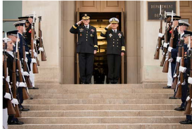
ROK JCS Chairman Adm. Choi Visits Washington

On March 16, former prime minister Kim Hwang-sik officially announced his candidacy for Seoul mayor at the Saenuri Party headquarters. Currently, the other two candidates are Chung Moon-joon, a seven-term lawmaker, and former lawmaker Lee Hye-hoon. The Saenuri party's primary will be held on April 25.