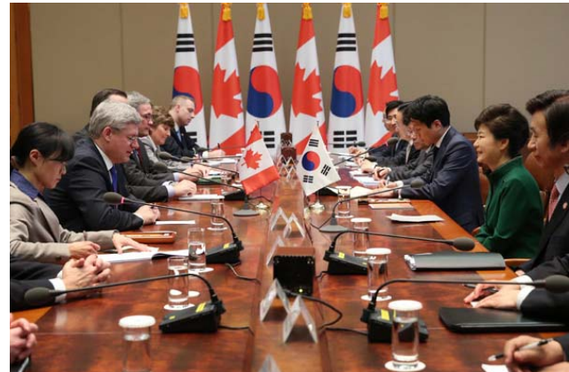
ROK-Canada Bilateral FTA Negotiations Concluded

On March 11, President Park Geun-hye and Prime Minister Stephen Harper of Canada announced that, after nearly nine years of negotiations, the ROK and Canada have concluded a bilateral FTA. The deal will phase out Canada's tariffs on Korean cars within 2 years while Korea reduces its tariffs on Canadian beef over 15 years. The FTA is expected take effect next year, following official signing of the agreement and domestic ratification in both countries. South Korea is the first Asian country to have a bilateral FTA with Canada.