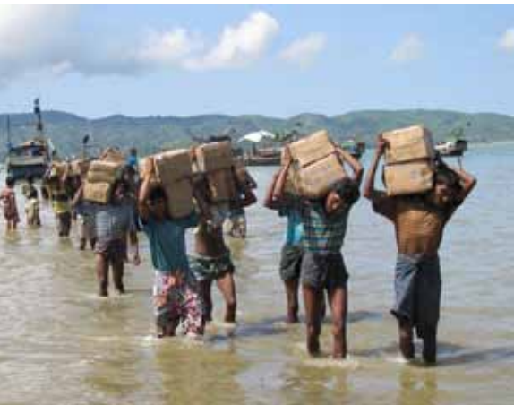
Internally displaced Rohingya in Myanmar. Thailand deported around 1,300 Rohingya back to Myanmar, where they face discrimination and persecution.