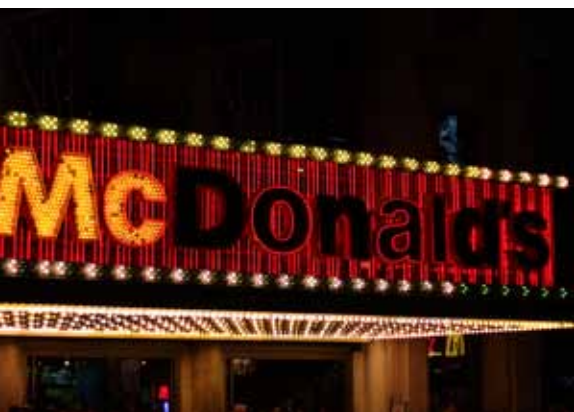
McDonald's opened its first restaurant in Vietnam in Ho Chi Minh City on February 8.