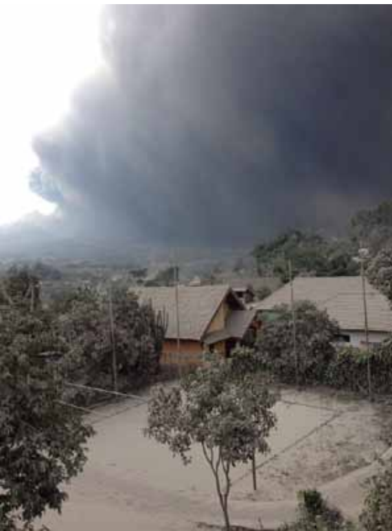
Ash rises from Mount Kelud, East Java, during an eruption that killed three people and forced more than 100,000 to evacuate.