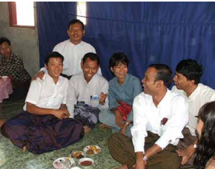
Leaders of the 88 Generation Peace and Open Society group. The organization recently announced a partnership with the National League for Democracy to fight for constitutional change.