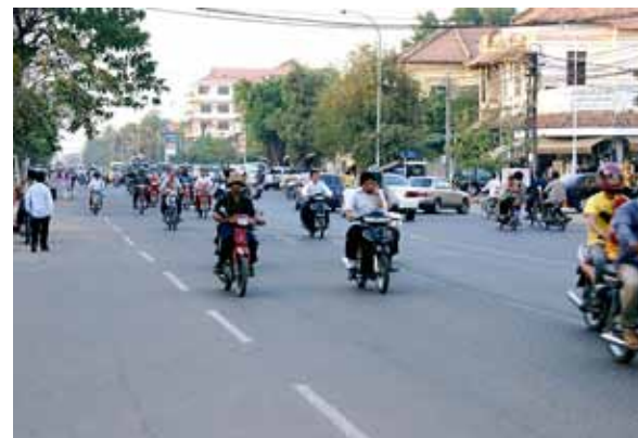
A street in Phnom Penh, where the city government recently introduced a pilot public bus service to relieve traffic problems.