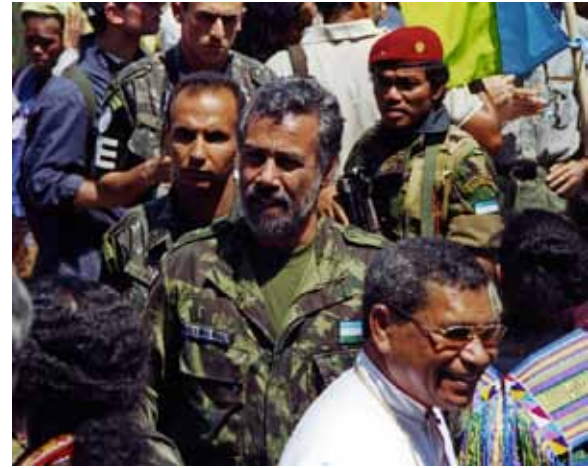
Timor-Leste's prime minister Xanana Gusmão being released from an Indonesian prison in 1999. Gusmão recently signed an agreement to purchase weapons from Indonesia for the first time, highlighting the remarkable improvement in relations between Timor-Leste and its former occupier. http://en.wikipedia.org/wiki/File:Aileu_Falintilcamp_Okt_%2799,_Xanana_kehrt_zur%C3%BCck-01.jpg