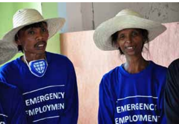
The Philippine government, with the support of the International Labor Organization, rolls out emergency employment programs in areas most affected by Typhoon Haiyan. President Benigno Aquino has ordered his cabinet to intensify job creation and social protection programs amid rising unemployment.