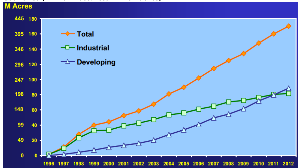
Figure 2. Global Area of Biotech Crops, 1996 to 2012: Industrial and Developing Countries (million hectares, million acres)

Source: M. Narvaro et al., From Monologue to Stakeholder Engagement , ISAA Brief 45, 2013, www.isaaa.org/resources/publications/briefs/45/ .