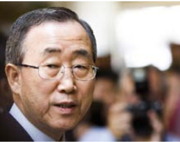
U.N. secretary general Ban Ki-Moon paid a three-day visit to Cambodia.