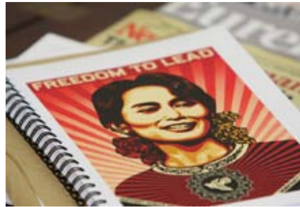
According to Burmese foreign Minister Nyan Win, Aung San Suu Kyi may be released after the elections.

• Bangkok to vote on Cambodian-Thai border. Prime Minister Abhisit Vejjajiva informed a group of Cambodian reporters in Bangkok that Thailand’s National Assembly is set to deliberate on the minutes of a bilateral joint border committee (JBC) meeting between Thailand and Cambodia held on October 26, 2010. Negotiations of the JBC were suspended last year because the Thai parliament had not endorsed the agreed minutes. The documents stipulate joint demining and demarcation projects along the border near the Preah Vihear temple and redeployment of soldiers in the zone in order to diffuse border tensions. The parliament’s