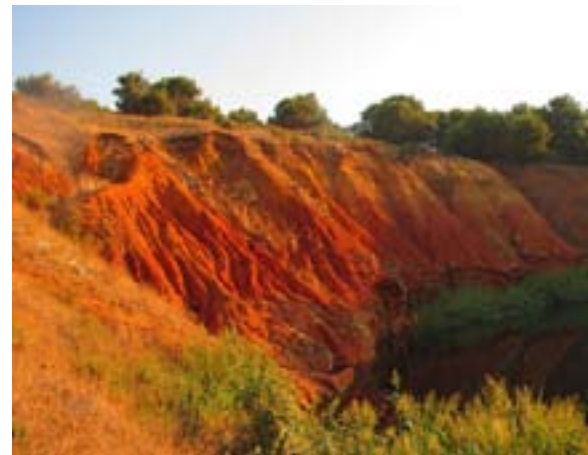
Non-governmental actors are protesting against bauxite mining projects in Vietnam.

• Vietnamese government evaluates the near collapse of state-owned Vinashin. Vinashin, Vietnam's state-owned shipbuilding firm, was founded in 1996 and became one of the country's eight Economic Groups in 2006. It contributed more than $169.6 million to the government's budget by the end of 2009. However, in the last two years, the firm has incurred tremendous losses as a result of the global financial crisis. Instead of accurately reporting its deficit, Vinashin officials claimed to have earned $38.25 million in profit while actually losing $81.6 million. Because Vinashin is a state-owned company, the government plays a significant role in responding to this crisis. Vietnamese prime minister Nguyen Tan Dung attributed this situation to “managerial weakness, a lapse in responsibility, [and] deliberate violations and the falsification of financial reports....”