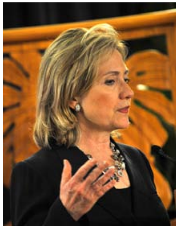
U.S. secretary of state Hillary Clinton visits seven Asian countries, demonstrating U.S. commitment to sustained and deep engagement with Southeast Asia.

For his part, President Obama has accepted responsibility for