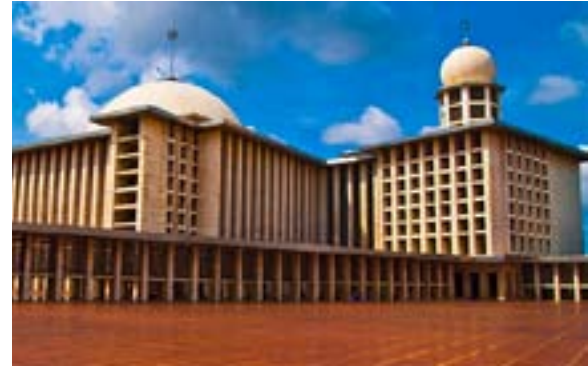
Istiqlal Mosque in Jakarta is the largest mosque in Southeast Asia. Istiqlal is the Arabic word for “independence.”