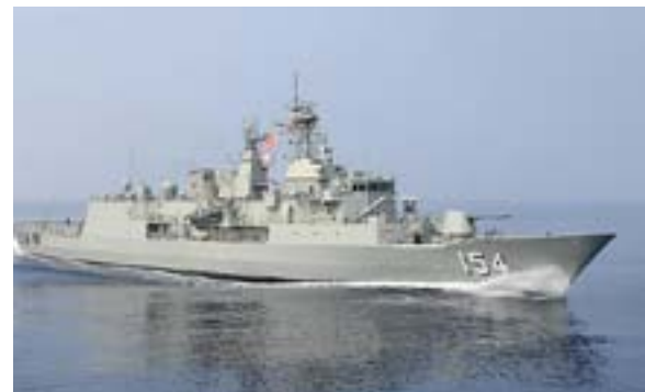
China expands its naval fleet amidst disputes with ASEAN, Japan, and South Korea.