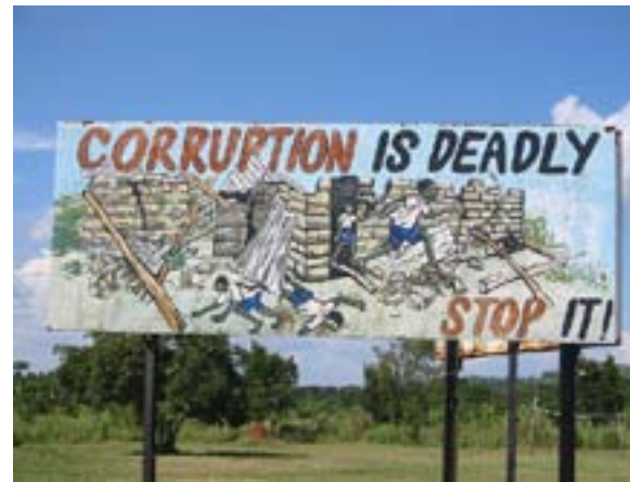
Malaysia needs to be firmer in fighting corruption.

• Philippines to deepen cooperation with Vietnam. President Aquino will sign four landmark memorandums of agreement (MOAs) with Vietnam when he visits the country for the East Asia Summit. Aquino's visit is by invitation of Vietnamese president Nguyen Min Triet and is his first