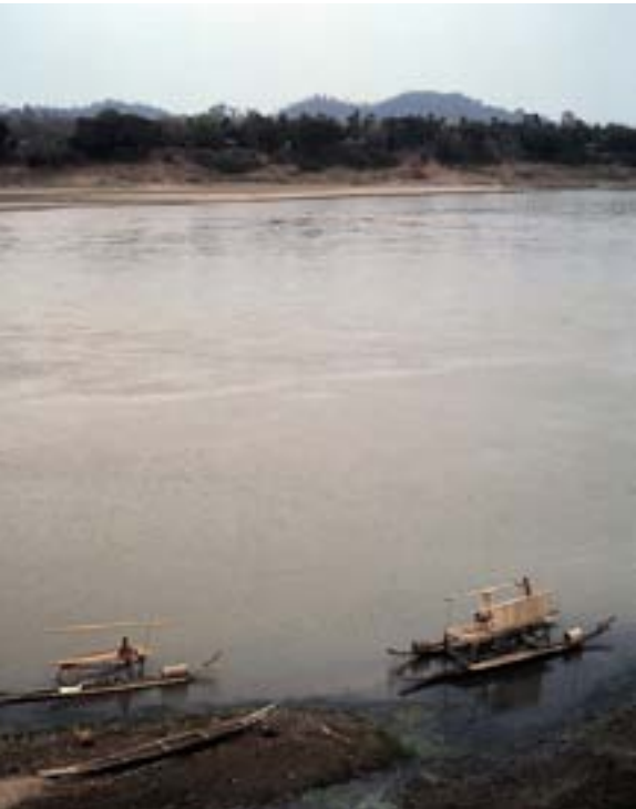
The construction of dams in the lower Mekong region threatens the source of livelihood for 65 million people.

recommended deferring dam construction for the next 10 years. It cited the catastrophic consequences for fish stocks that could be caused by the mainstream dams.