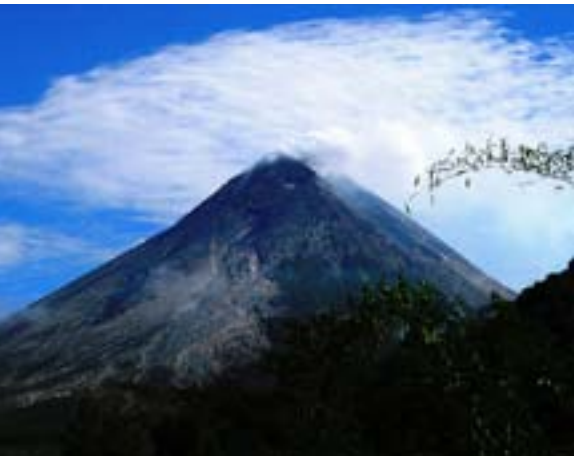
Mount Merpai in Indonesia.

• Cyclone Giri displaces thousands in Burma. Cyclone Giri hit Burma's western Rakhine state last week, destroying the major town of Kayaukpyu. According to the UN Office for the Coordination of Humanitarian Affairs (UNOCHA), at least 90 have been killed, 70,000 displaced, and 175,000