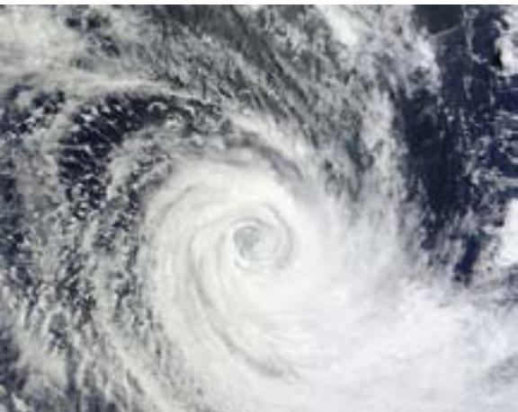
Cyclone Giri sweeps Burma's western coastal states, killing at least 90 and displacing 70,000.

others impacted. With wind speeds up to 155 miles per hour, the storm was more powerful than Cyclone Nargis, which claimed around 140,000 lives in 2008. Aid groups, such Myanmar Red Cross and the Social Welfare Ministry, have set up temporary camps to shelter more than 5,000 people.