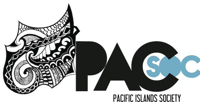
Above: PacSoc’s official logo.