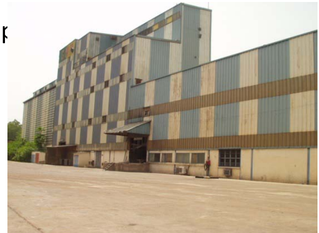
Site de production à Koulikouro (60 km de Bamako)