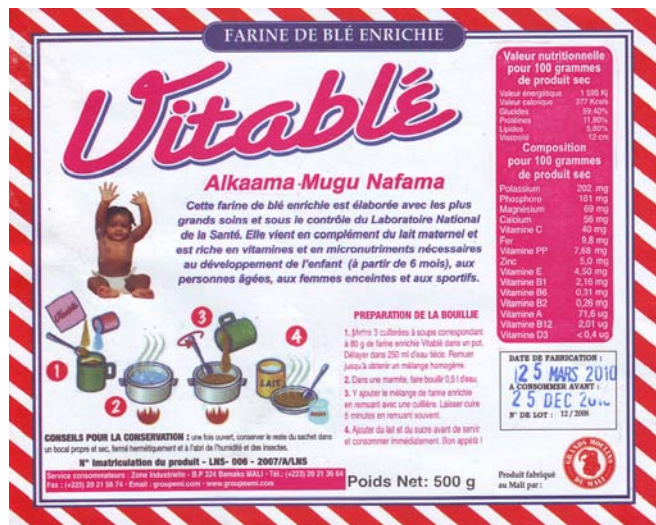
Emballage de Vitablé

This product is recomanded by Red Cross, WFP, and other NGO locally installed.