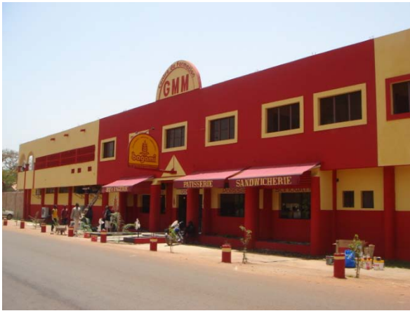
Bagami à Bamako

Bagami is a bakery, viennoiserie and patisserie concept