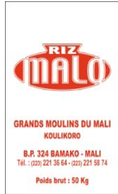
Sac de riz local

Capacity: 30 000 tons / year Paddy buyings : 2009 : 10 000 tons