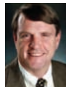
Leonard Downie, Jr.

Leonard Downie, Jr. recently became vice president at large of the Washington Post . He has served as executive editor of the Washington Post since September 1, 1991, after serving as managing editor for seven years. Downie joined the Post as a summer intern in 1964. He worked on the metropolitan staff as a reporter and editor for 15 years and ran the staff as assistant managing editor for metropolitan news from 1974 until 1979. As deputy metropolitan editor, Downie supervised the Post's Watergate coverage. He was named London correspondent in 1979 and returned to Washington in 1982 as national editor. In 1984, he became managing editor. Downie is a director of the Los Angeles Times-Washington Post News Service.