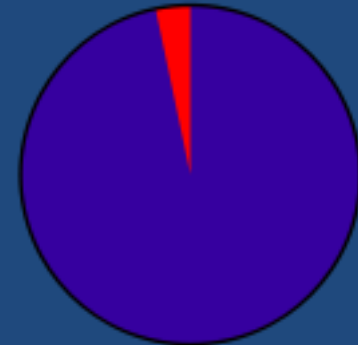
Low-enriched uranium (reactor grade) 3-4% U-235