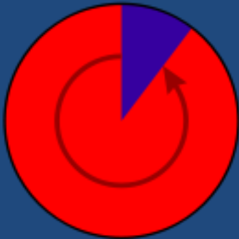
Highly enriched uranium (weapons grade) 90% U-235

Highly Enriched Uranium (HEU) → Low Enriched Uranium (LEU)