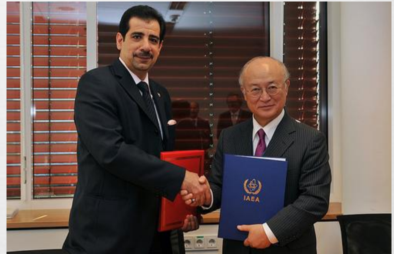
Mr. Abdulla Abdullatif Abdulla, Undersecretary, Minister of Foreign Affairs of the Kingdom of Bahrain and IAEA Director General Yukiya Amano