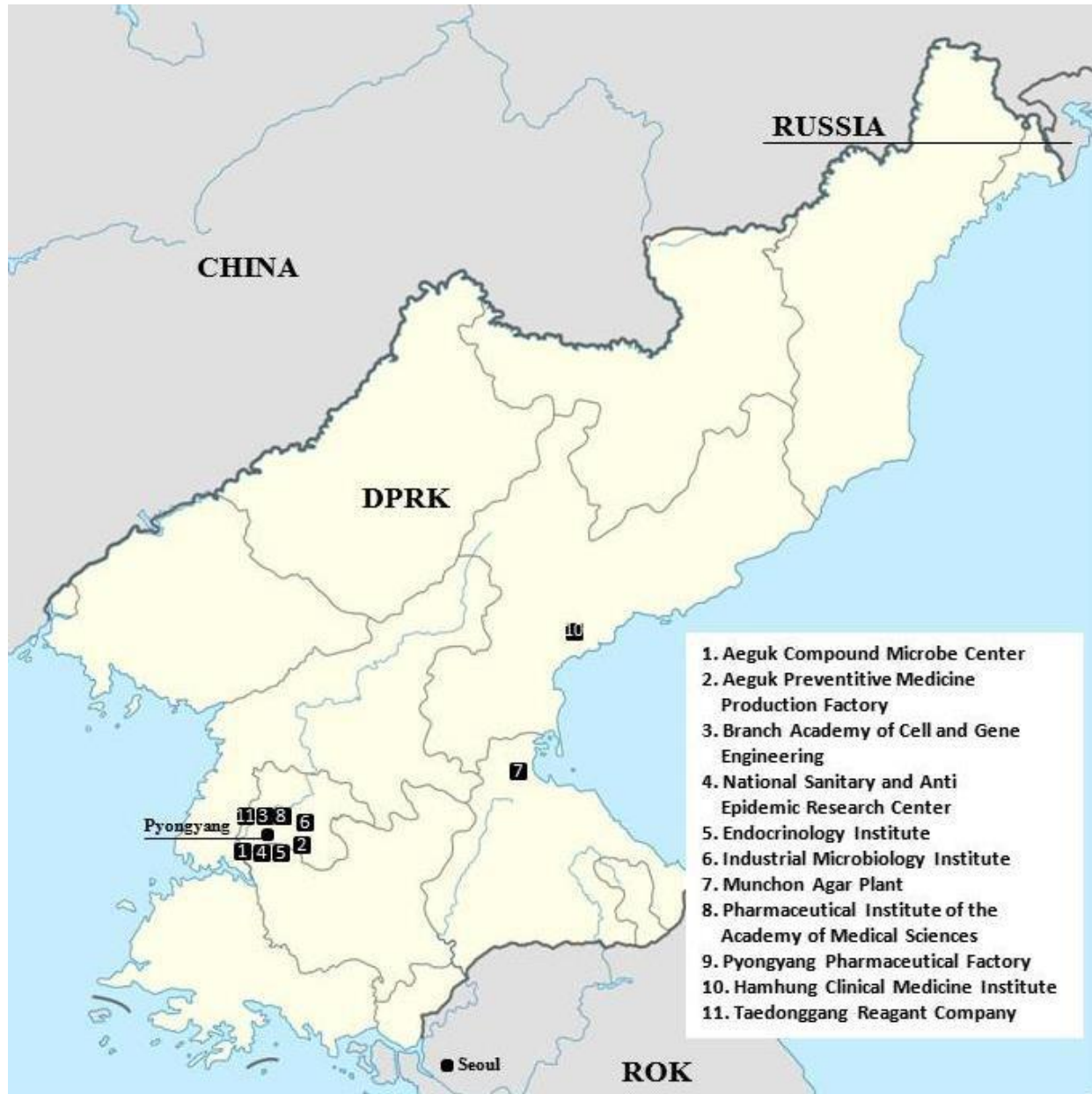
Figure Six: Map of Possible North Korean Biological Facilities