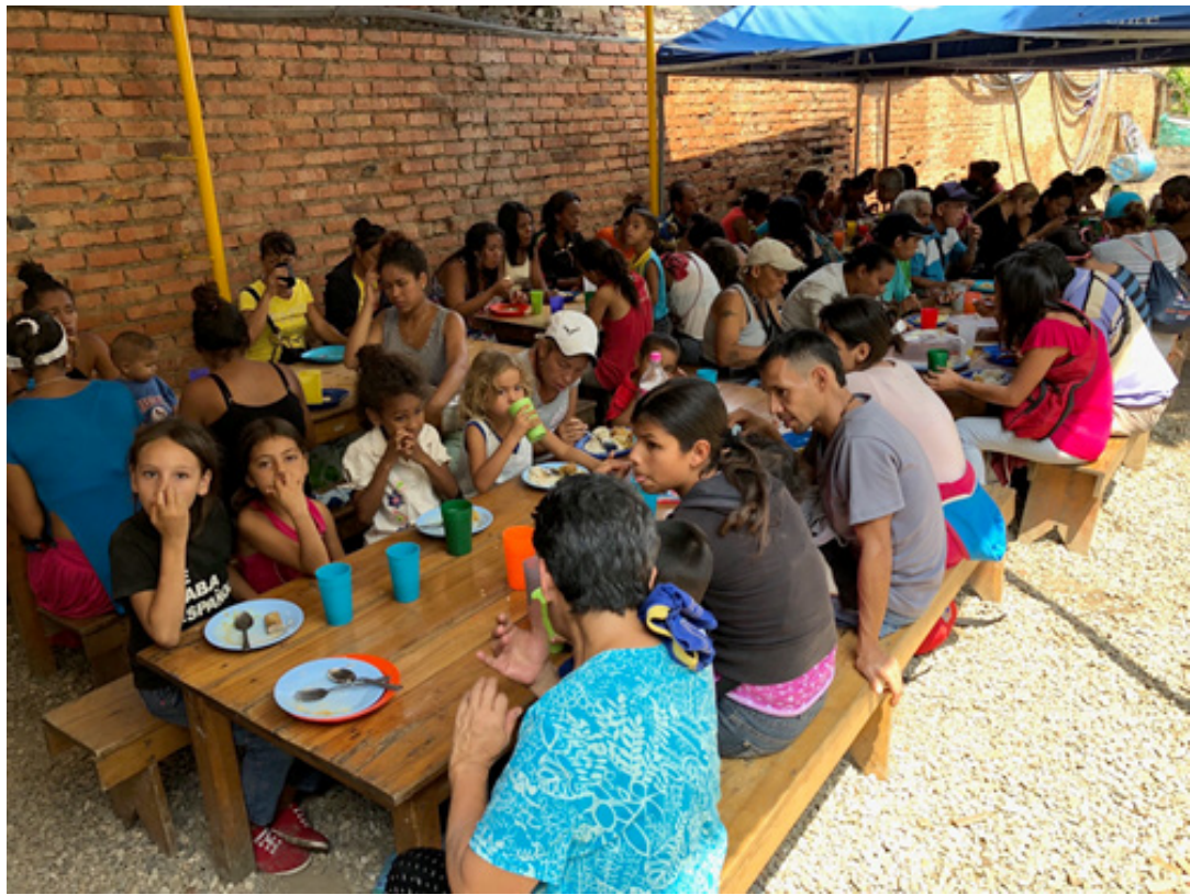
Venezuelan refugees and migrants eating at one of the meal distribution centers run by the Diocese de Cúcuta.

independent groups that are able to carry out surveys and derive current data on the health system is critical. Many of these same groups are willing to engage in under-the-radar distribution of life-saving help and technology, which can assist these efforts to succeed. The Venezuelan diaspora, mostly in the United States, Spain, Colombia, and Panama, now estimated at 4 million, should be engaged to help strengthen both on-the-ground civil society engagement and longer-term reconstruction efforts.